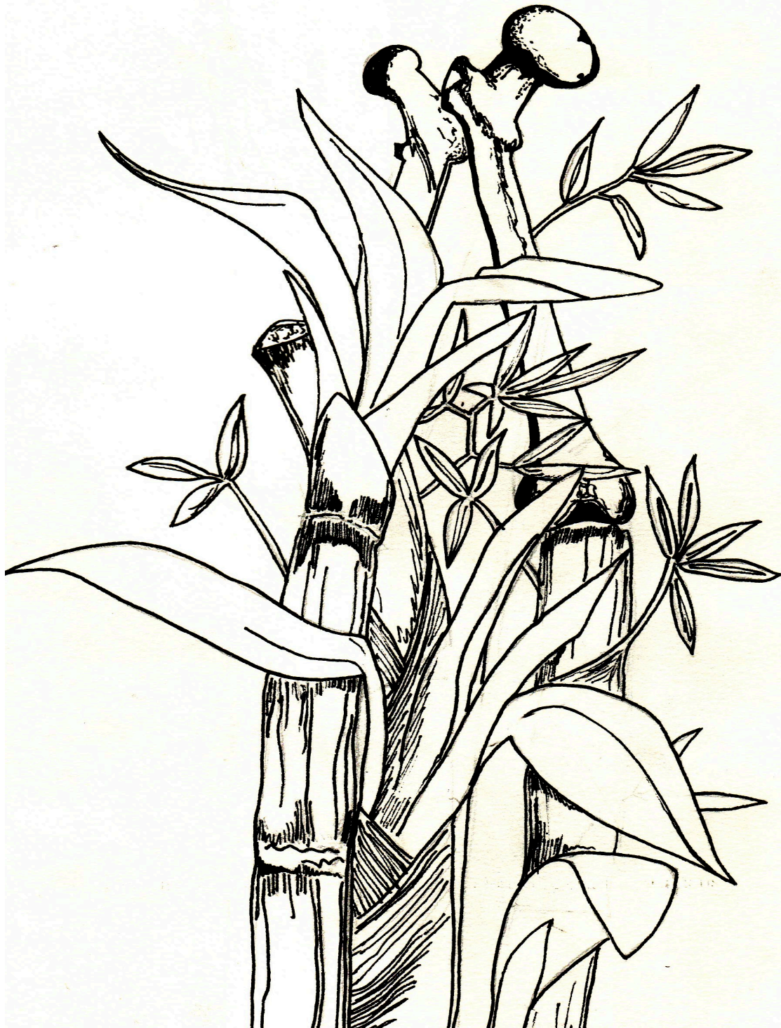
Drawing by Joe Olbrych